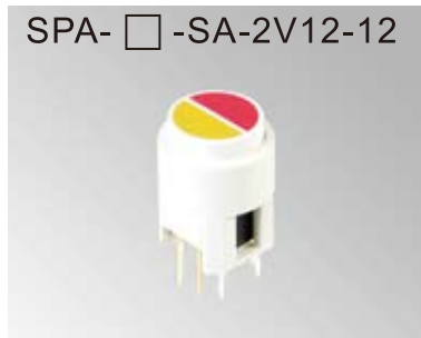
SPA- □ -SA-2V12-12

50mA 12V DC (T Type) 100mA 30V DC (M Type · A Type) SIZE: 10.0x7.9x13.0mm Round Type LED Color: Red / Yellow □ = Function T = Click Type, 4 PIN M = Non Click Type, 6 PIN A = Lock Type, 6 PIN