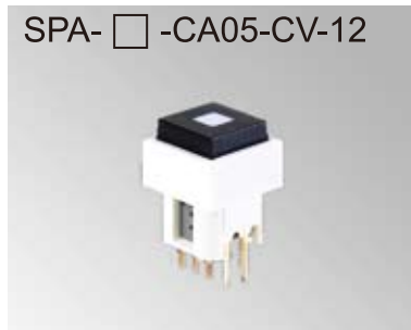
SPA- □ -CA05-CV-12

50mA 12V DC (T Type) 100mA 30V DC (M Type · A Type) SIZE: 10.0x7.9x13.0mm Square Type LED Color: Red / Yellow □ = Function T = Click Type, 4 PIN M = Non Click Type, 6 PIN A = Lock Type, 6 PIN