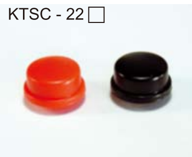
KTSC - 22

SIZE: Ø 13mm, 內徑3.8mm Color: K=Black, B= Blue, G=Green, I=Ivory, R=Red, Y=Yellow For TS-2201T