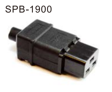
16A 250V AC