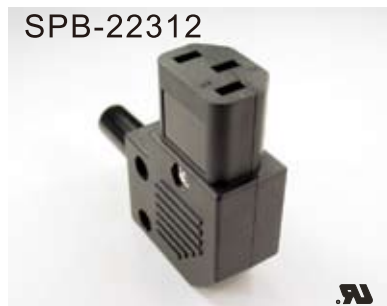
10A 250V AC Right Angle