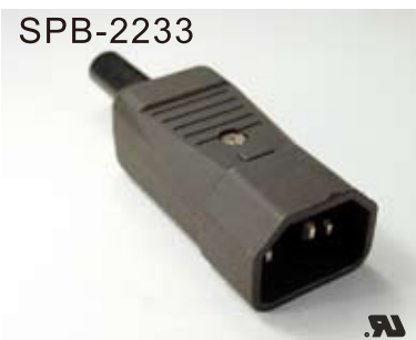
10A 250V AC