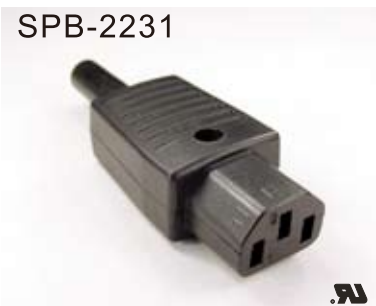
10A 250V AC