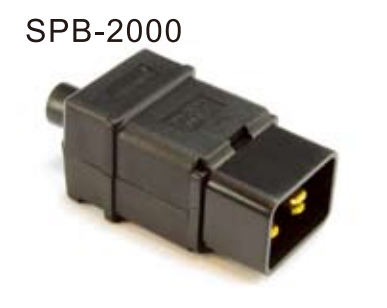
16A 250V AC