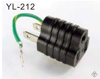
15A 125V AC