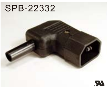
10A 250V AC Right Angle