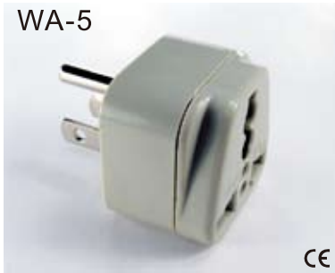
15A 125V / 10A 250V AC Multi-purpose ETL