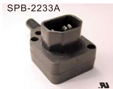
10A 250V AC Right Angle