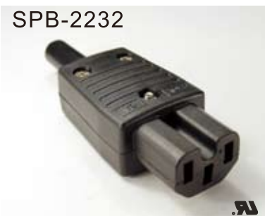
10A 250V AC