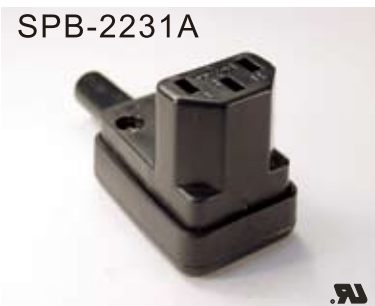
10A 250V AC Right Angle