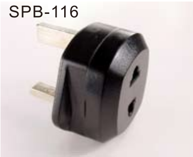
13A 250V AC WITH FUSE