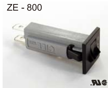
ZE - 800

1.5~20Amp 125/250VAC 32VDC Mounting Hole: 15.2x13.5mm UL - 2 ~ 18A 125/250V AC CSA - 3 ~ 15A 125V AC