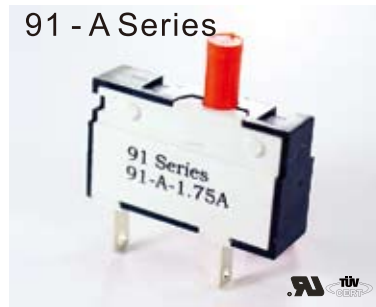
91 - A Series

1~10Amp 125/250VAC 50VDC Size: 25.6x8x15.2mm